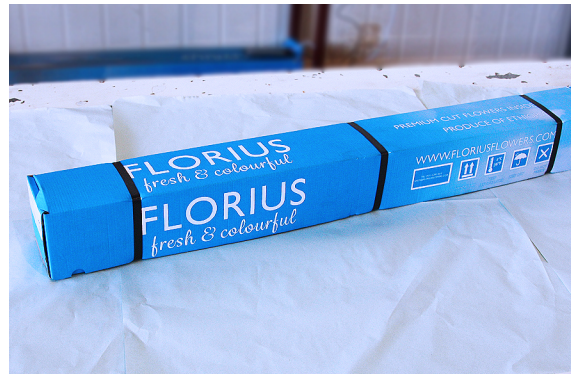
Photo of a well-packed box.

Secure each box with plastic straps (as seen on the photo above).