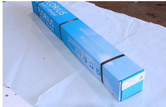
Photo of a well-packed box.

Secure each box with plastic straps (as seen on the photo above).